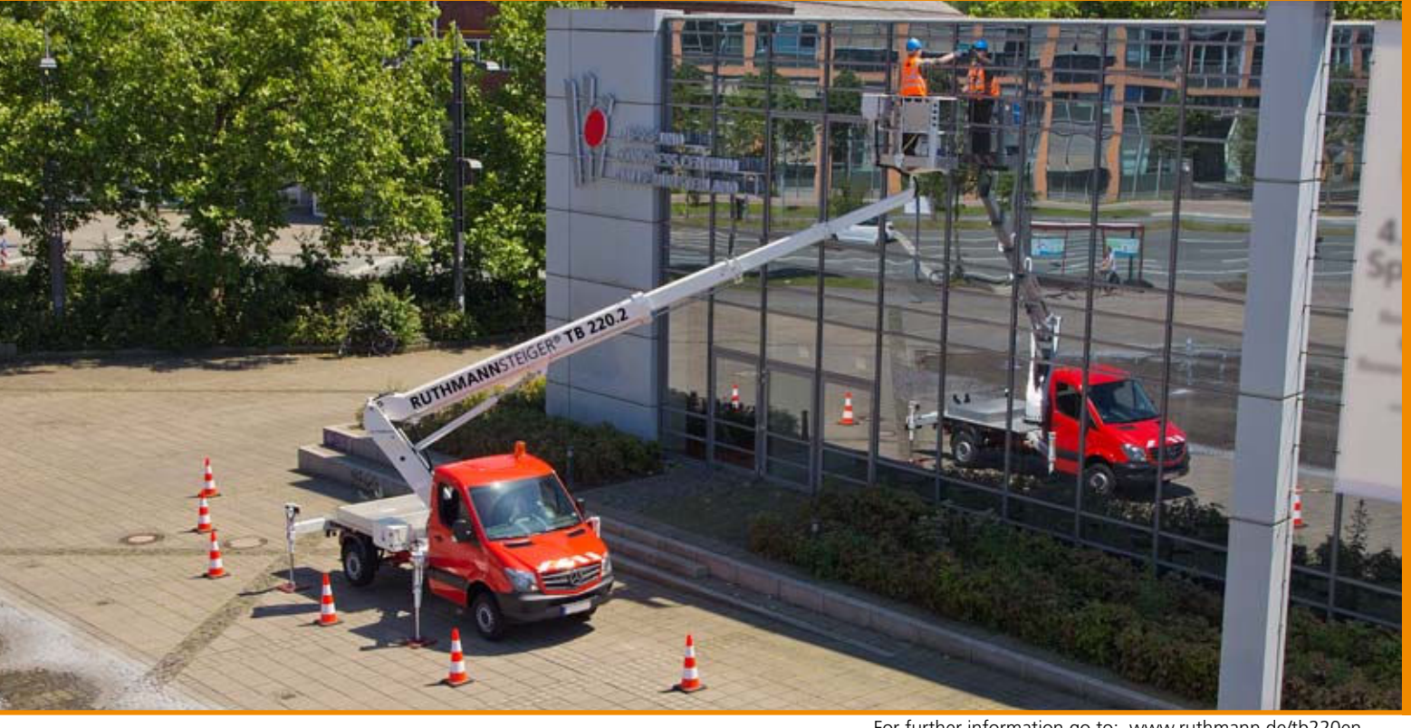
For further information go to: www.ruthmann.de/tb220en